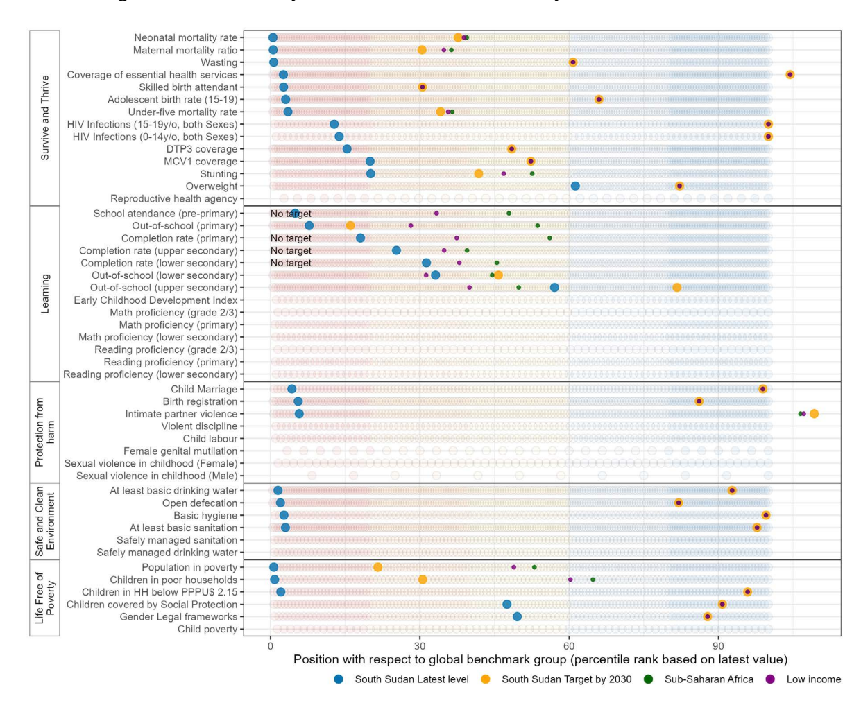
Figure 3. Benchmarking where the country is and where it aims to be by 2030

For a global narrative using this methodology please see UNICEF 2023 SDG Report. For more detailed information including indicator value and latest year available please visit our Online South Sudan SDG profile at data.unicef.org/sdgs.