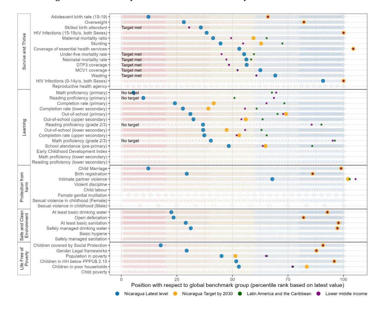
Figure 3. Benchmarking where the country is and where it aims to be by 2030

For a global narrative using this methodology please see UNICEF 2023 SDG Report. For more detailed information including indicator value and latest year available please visit our Online Nicaragua SDG profile at data.unicef.org/sdgs.