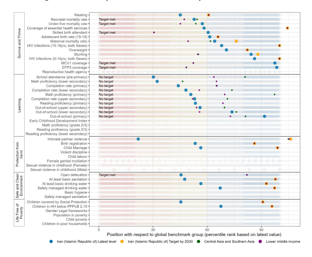
Figure 3. Benchmarking where the country is and where it aims to be by 2030

For a global narrative using this methodology please see UNICEF 2023 SDG