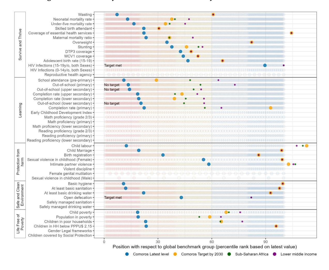
Figure 3. Benchmarking where the country is and where it aims to be by 2030

Source: UNICEF Chief Statistician Office using data from UNICEF Data Warehouse as of August 2023. For a global narrative using this methodology please see UNICEF 2023 SDG Report. For more detailed information including indicator value and latest year available please visit our Online Comoros SDG profile at data.unicef.org/sdgs.