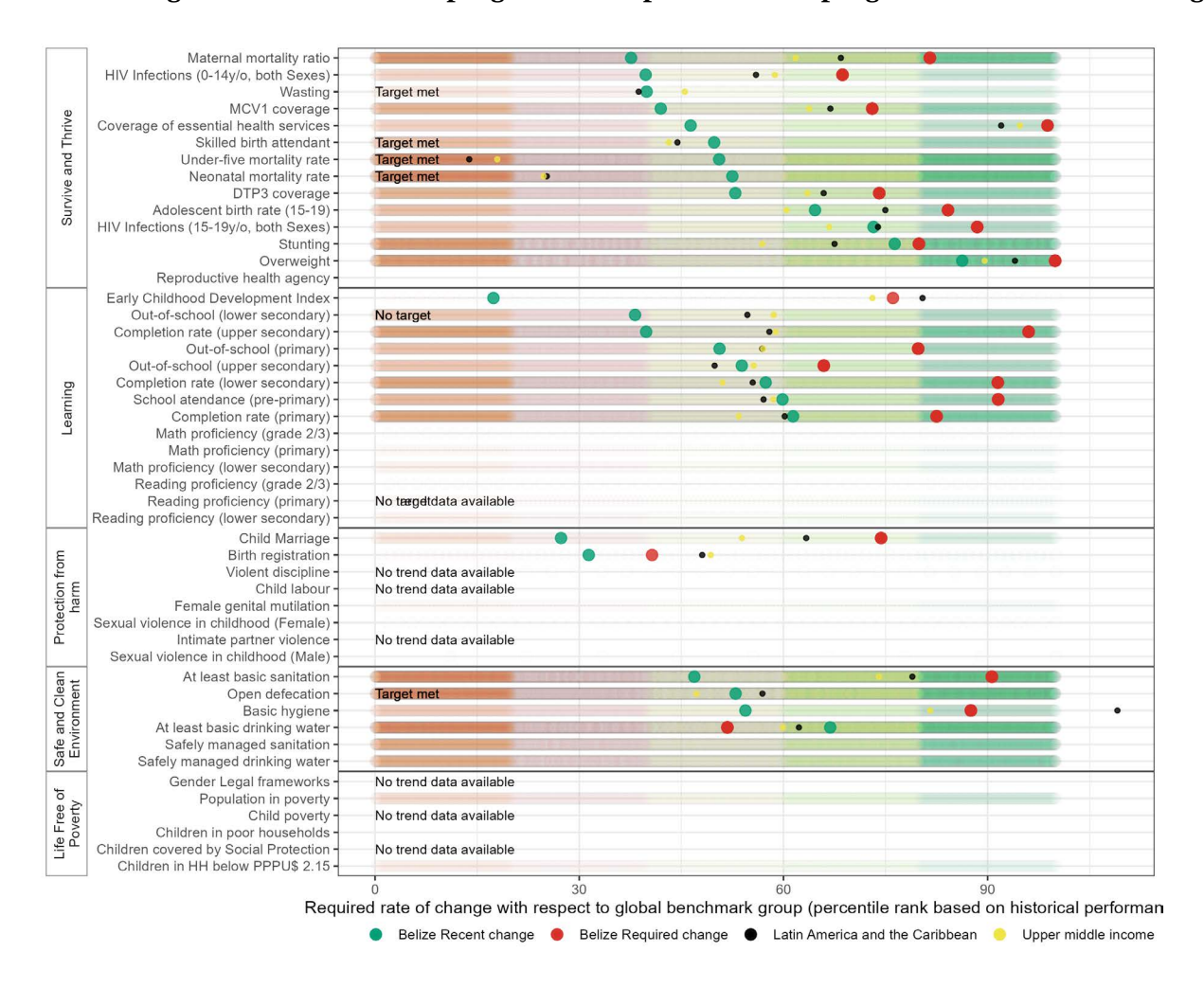
Figure 4. Benchmarking the historical rate of progress and expected rate of progress to meet the 2030 target

Source: UNICEF Chief Statistician Office using data from UNICEF Data Warehouse as of August 2023. For a global narrative using this methodology please see UNICEF 2023 SDG Report. For more detailed information including indicator value and latest year available please visit our Online Belize SDG profile at data.unicef.org/sdgs.