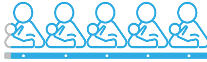
Figure 1 Share of babies that are breastfed in high-, low- and middle-income countries.

In low- and middle-income countries, almost all babies are breastfed